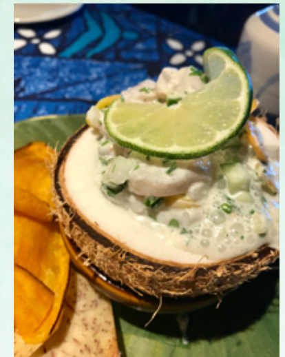
MAMA'S FISH HOUSE