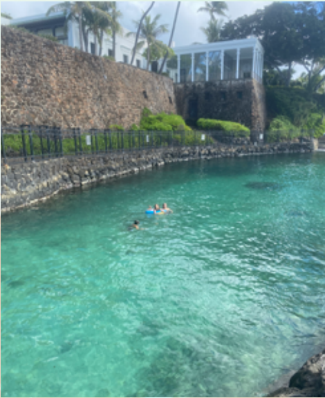
THE DORIS DUKE ESTATE

They drop you over the side of the boat on a shortened water ski rope so it actually feels like your swimming with the dolphins. Not only do you cruise to find dolphins and then swim alongside them, but you also go to a great snorkeling place where not a lot of people can get to. www.dolphinexcursions.com