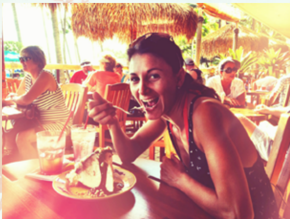
YUM! THE HULA PIE AT DUKE'S IS DELICIOUS!

Ahi's: For real, authentic, old-school Hawaiian-style grindz, this is your go-to place. It's not fancy, and it's small, but it's the real deal. It's a little unknown spot on the Ewa side of Kapahulu by the Chevron Station. There's no web site so you'll have to ask around once you're on Kapahulu.